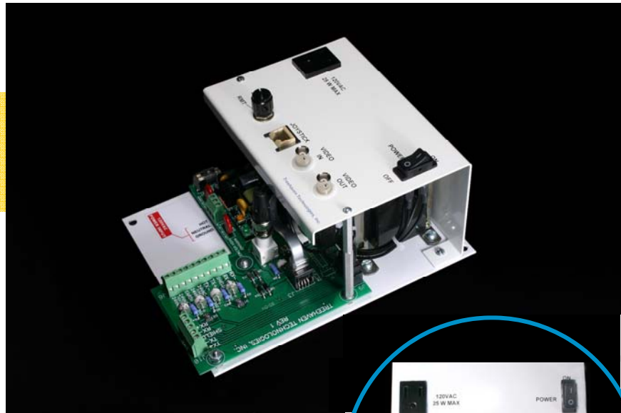
Model Number - RVSFB120X

The Remote Vision System Field Box is an economical, robust CCTV field mounted accessory that provides an assortment of camera power, data, local camera setup and communications capability in a small foot print assembly.