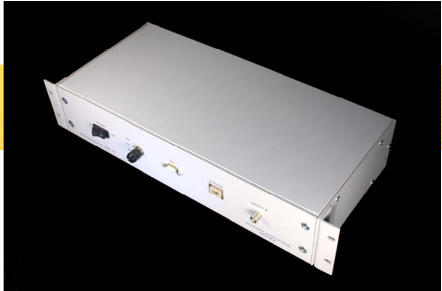
Model Number - RVSFB120R