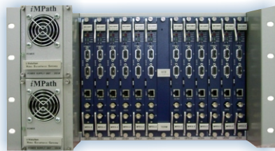
VSG Video Surveillance Gateway

The i-Volution Video Surveillance Gateway (VSG) is a modular, chassis-based concentrator providing multi-channel transport capability for advanced surveillance applications requiring high resolution, full motion video. The VSG can encode and/or decode up to 24 MPEG-1/MPEG-2 video streams and 24 serial data channels over standards-based IP networks. The MPEG video streams can be viewed simultaneously from any PC and/or CCTV monitor in the network. The VSG supports MPEG dual port video encoder and dual port video decoder cards.